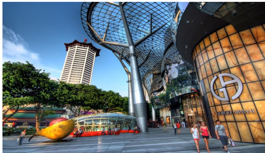
Trekking. Made in SG „Shopping Tour @ Orchard Road“