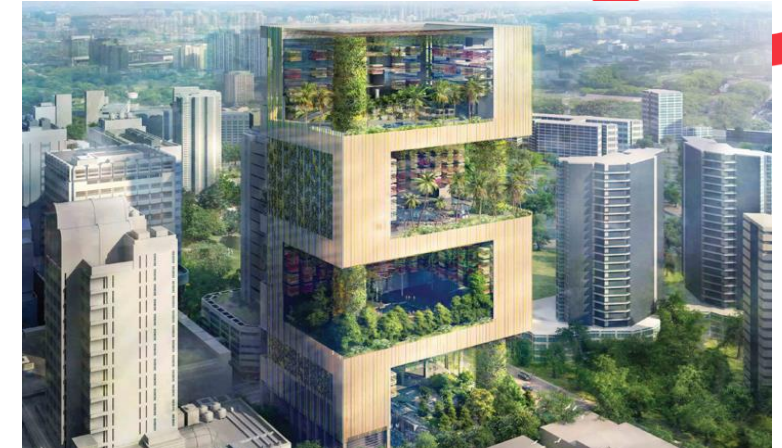
Pan Pacific Zero Waste Hotel