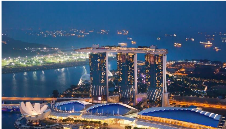
Marina Bay Sands