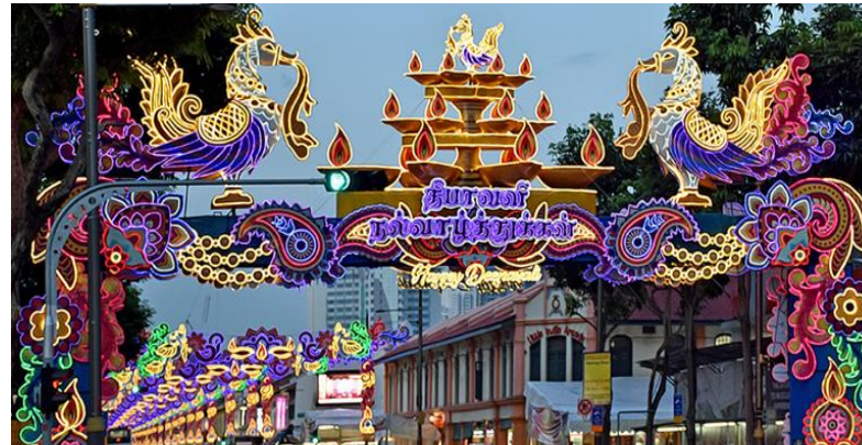
Little India (Deepawali Lichterfest)