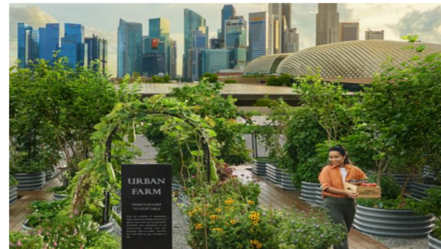
Farming. Made in SG „Farm to Table Workshop“