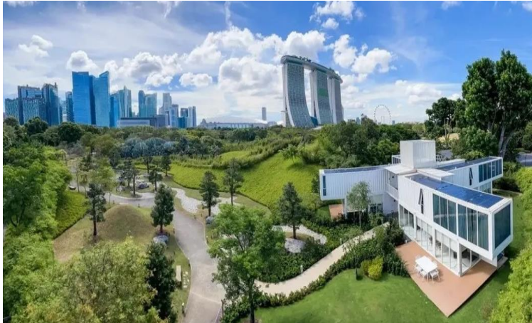
Garden Pods at Gardens by the Bay