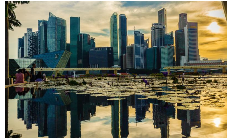
Marina Bay Skyline