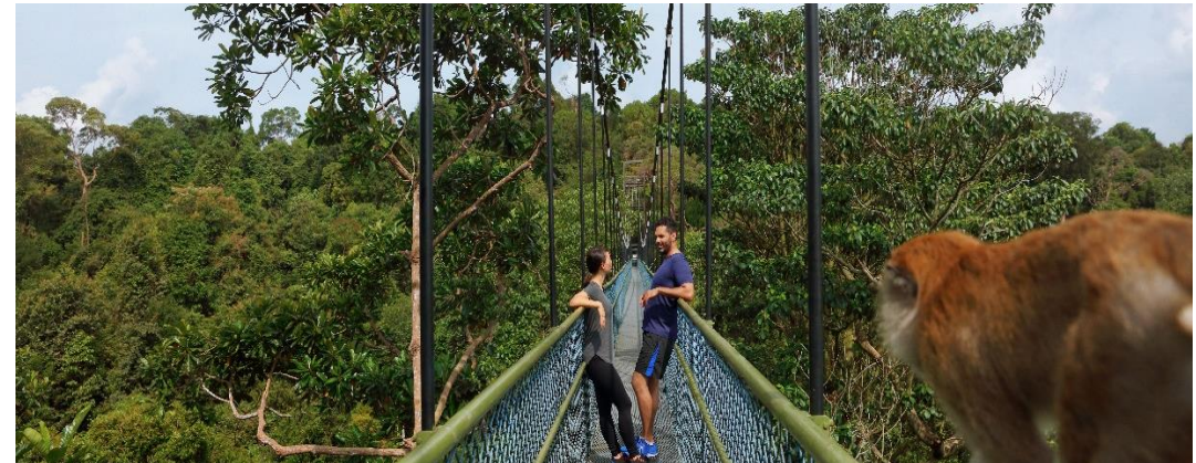
MacRitchie Treetop Walk