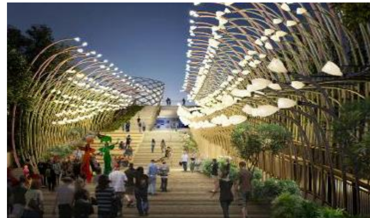
Sensoryscape Walk & Garden @ Sentosa