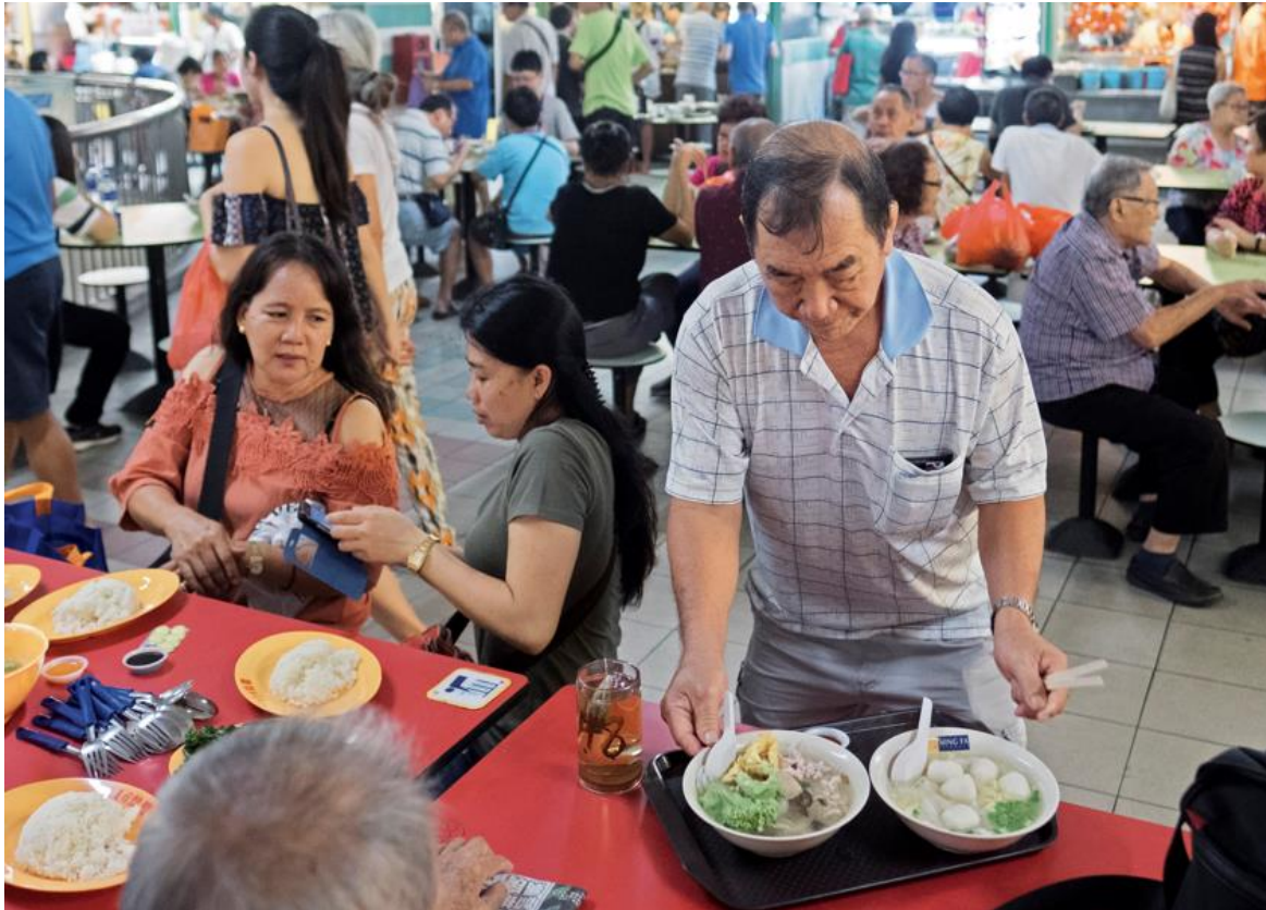
Hawker Centre / Food Court