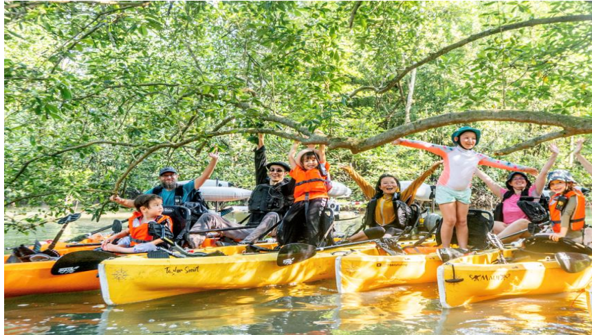
Joyrides. Made in SG „Kayaking Tour at Pulau Ubin“