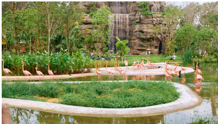
Bird Paradise @ Mandai