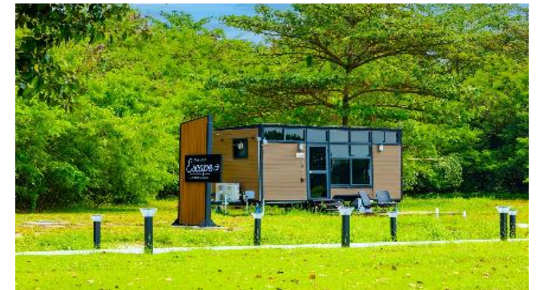
Tiny Away Escape @ Lazarus Island