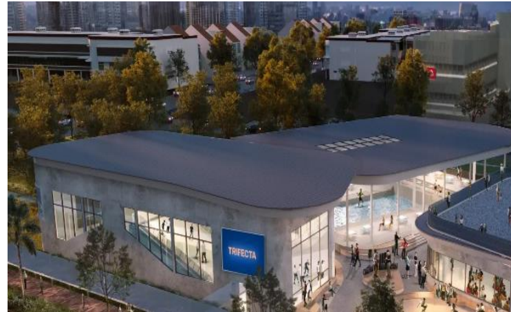
Trifecta Orchard Road