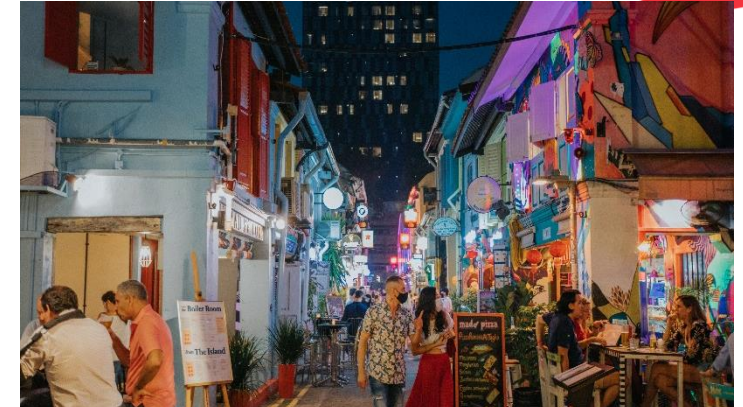
Haji Lane, Kampong Gelam