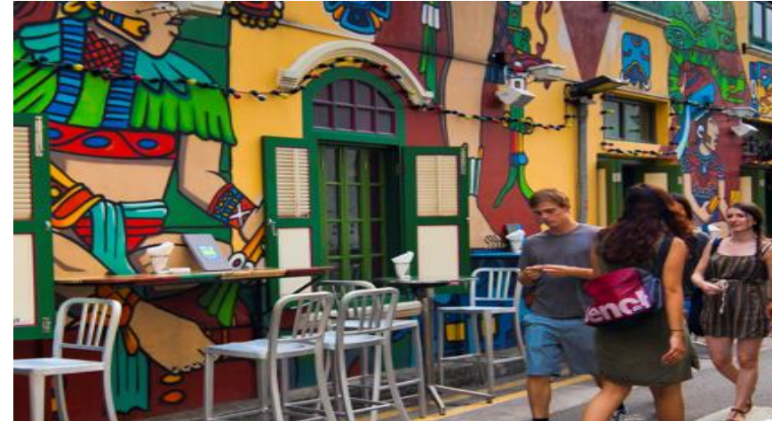
Insta-Worthy Spots. Made in SG „Instagram Walking Tours “