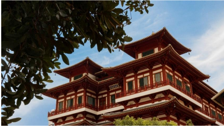
Buddha Tooth Relic Temple, Chinatown