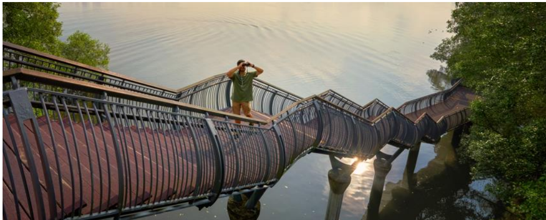
Sungei Buloh Wetland Reserve