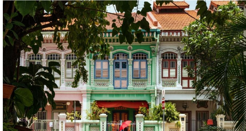
Shop Houses in Katong