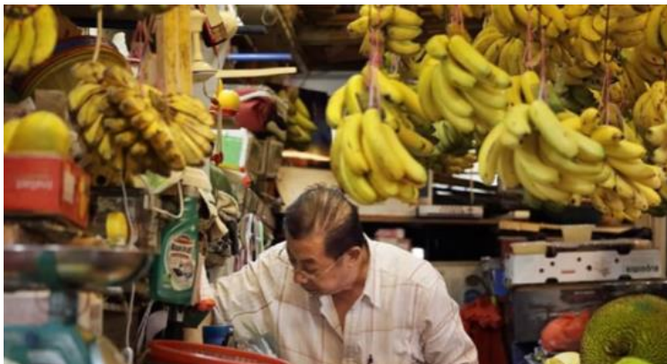
Wet Market (Frischprodukte-Markt)