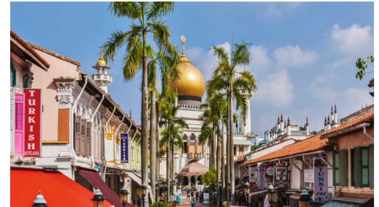
Sultan Mosque, Kampong Gelam